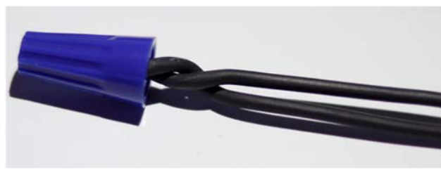
Proper Wire-Nut Tightening

These connectors allow the Controller to be completely removed if desired for the sale of the RV. These ¼" Quick-Connect Blade connectors can be found in most Automotive parts stores.