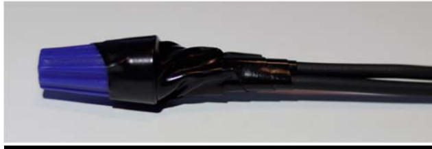
Recommended Wire-Nut Taping